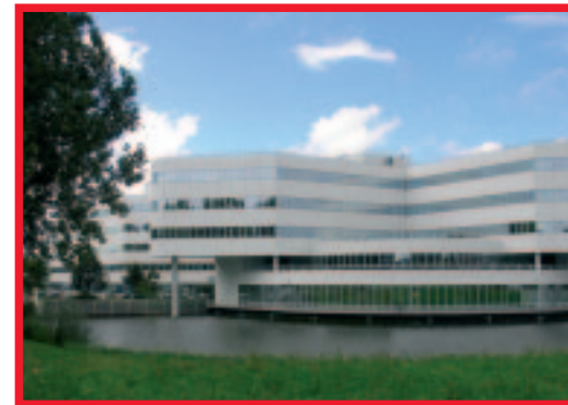
Canon Europe's offices in Amstelveen, The Netherlands.

Canon Europe has its headquarters in Amstelveen (the Netherlands) and sales offices in 12 European countries. The organization is in the process of moving from local to central IT facilities. A few years ago, Canon decided to enter into a full-scale consolidation, in which the IT support, with the exception of office computerization, would be provided centrally from the European head office in the Netherlands. Part of this extensive operation was the consolidation of all the company data in a single central Oracle database. The data comes from internal applications, such as HRM systems and ERP systems, as well as from external applications, including those for banking and warehousing.